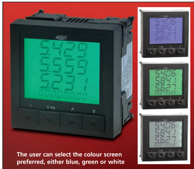
The user can select the colour screen preferred, either blue, green or white